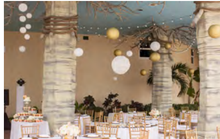
Banyan Grove and Patio