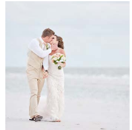
Additional chef's fee of $125* for each attended station.