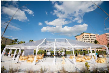
Tented or Beach Event