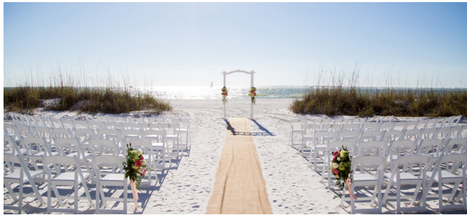
Sanibel View Beach Dunes