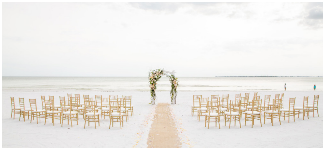
Sanibel View Beach